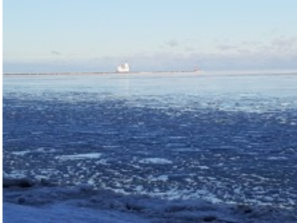
The big chill week, mid January 2024